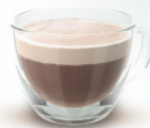
HOT MILK CHOCOLATE