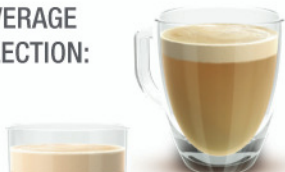
FRENCH VANILLA COFFEE